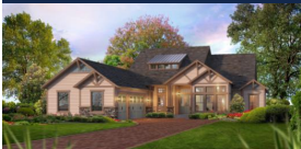
THE CRAFTSMAN II