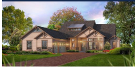
THE CRAFTSMAN II