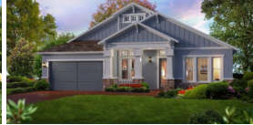
THE CRAFTSMAN - TILE