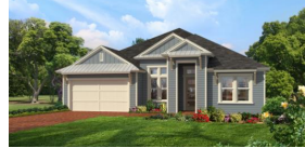
THE COASTAL MODERN - TILE