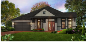
THE FARMHOUSE MODERN