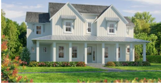
THE FRENCH QUARTER