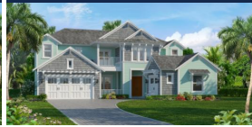
THE COASTAL - CR