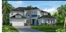
THE TRANSITIONAL COASTAL - CR